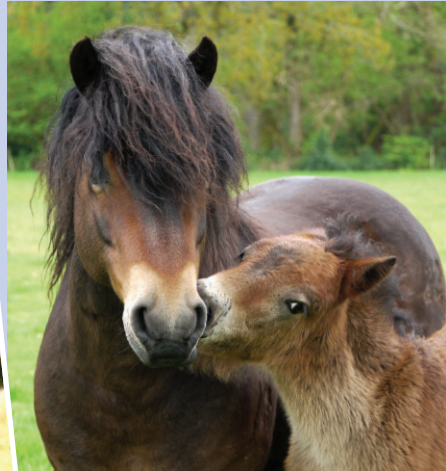
Above: Bear showing the interactive role stallions love to play with their foals