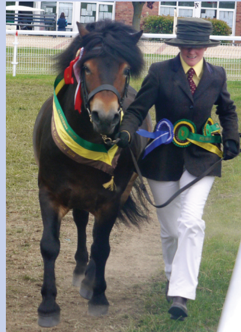
Below left: Winning the NPS Gold Medal Rosette Below right: Bear navigating a liberty weave