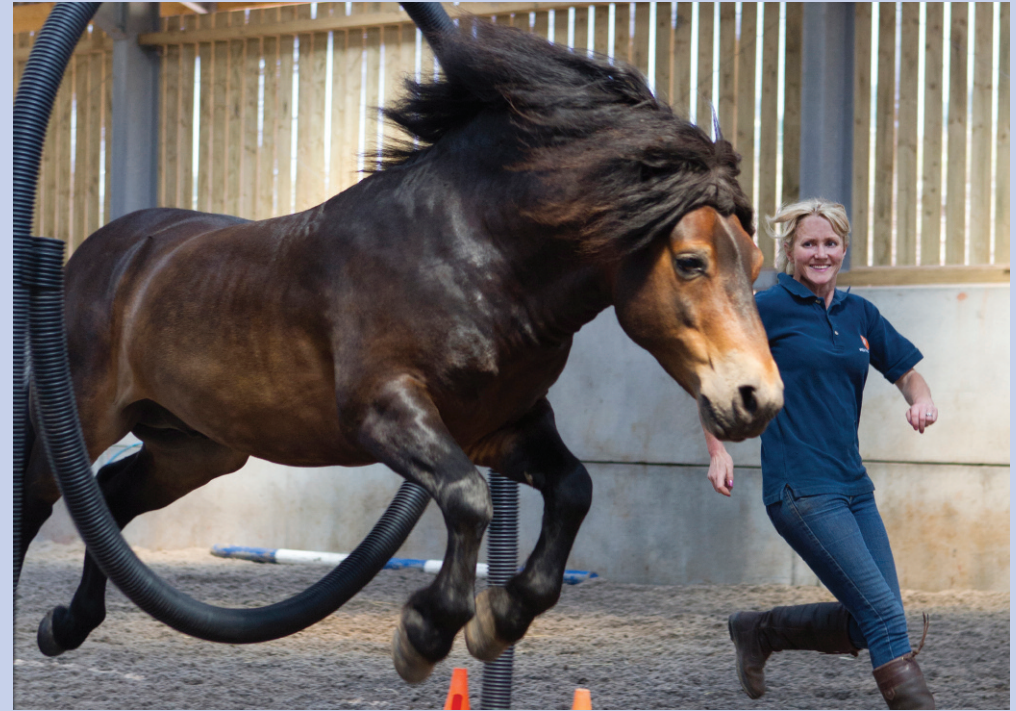
Above: Bear demonstrating his liberty agility skills